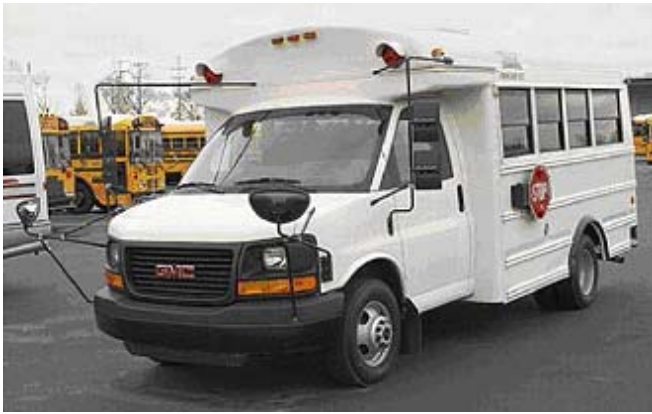
Small School Bus