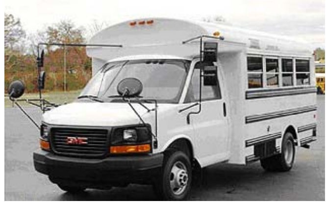
Multifunction School Activity Bus

Note: As illustrated above, a child care vehicle does not have to be painted school bus yellow (it can be yellow, but it does not have to be yellow). Ohio is still working on clarifying this requirement in law and rules.