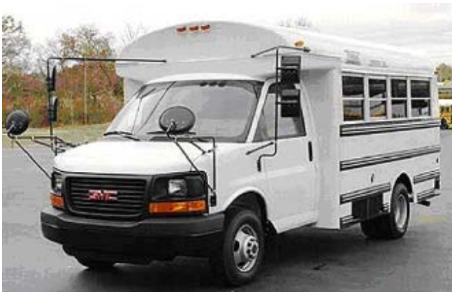
Multifunction School Activity Bus (“MFSAB”)

The “Multifunction School Activity Bus” (MFSAB) is designed to provide all of the crash safety standards that are found on a traditional school bus, but without the stop-sign arm and warning lights that traditional school buses need for frequent pick-up and drop-off at school bus stops. Thus, the vehicles in this category conform with all FMVSS requirements for school bus structural and crash standards, but are not required to have specialized warning devices such as stop signs and warning lights, and they are not required to be painted a specific color (i.e. school bus yellow).