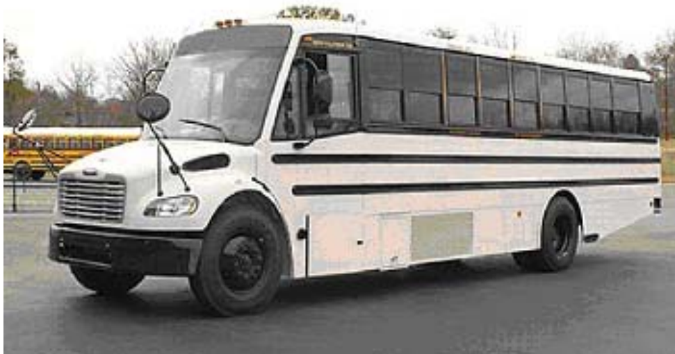
Large School Bus